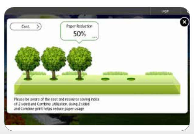
Eco-Friendly Indicator Screen as shown on the Smart Operation Panel.

You'll find just the opposite to be true with the Ricoh MP 4054/ MP 5054/MP 6054. It offers low cost-per-page and best-in-class typical electricity consumption (TEC) values so you can reduce costs while meeting your sustainability goals. With a shorter recovery time of less than 5 seconds from sleep mode, the Ricoh MP 4054/ MP 5054/MP 6054 keeps up with today's fast-paced business environment. You can program the device to power on or off during specified times to conserve energy for even greater savings. Plus, the device meets EPEAT® Gold* criteria — a global environmental rating system for electronic products — and is certified with the latest ENERGY STAR™ specifications.